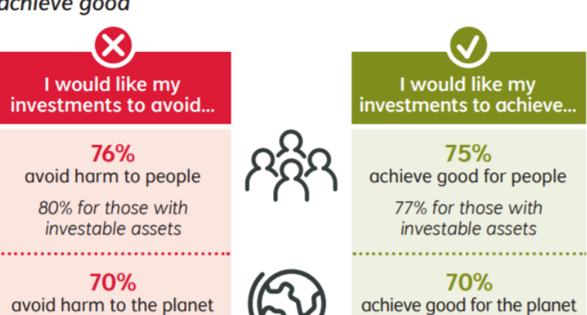
Figure 8 : Survey results for investments to avoid harm or achieve good